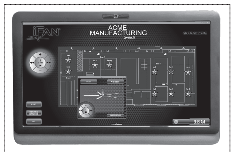
Dialog box for individual fan provides access to direction and speed settings for a specific fan.