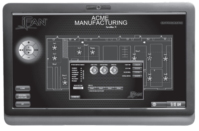
Timer setting dialog box enables direction and speed for individual HVLS fan or zones to be set by time of day.