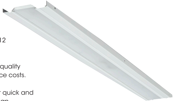
Front view. CK - LED Strip Light Conversion Kit with Frosted lens option shown above.