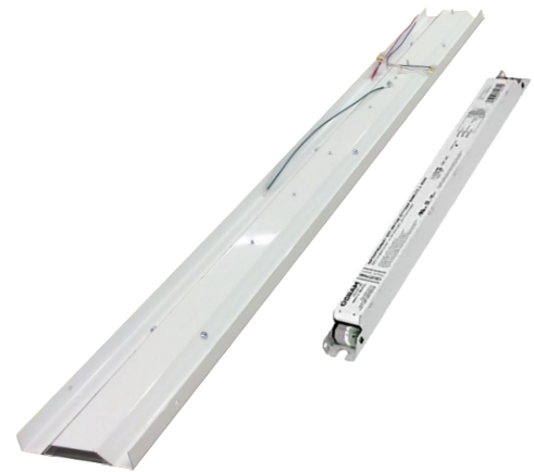
Back view. energybank CK - LED Strip Light Conversion Kit with 100W, 5000K LED light engine and driver shown above.